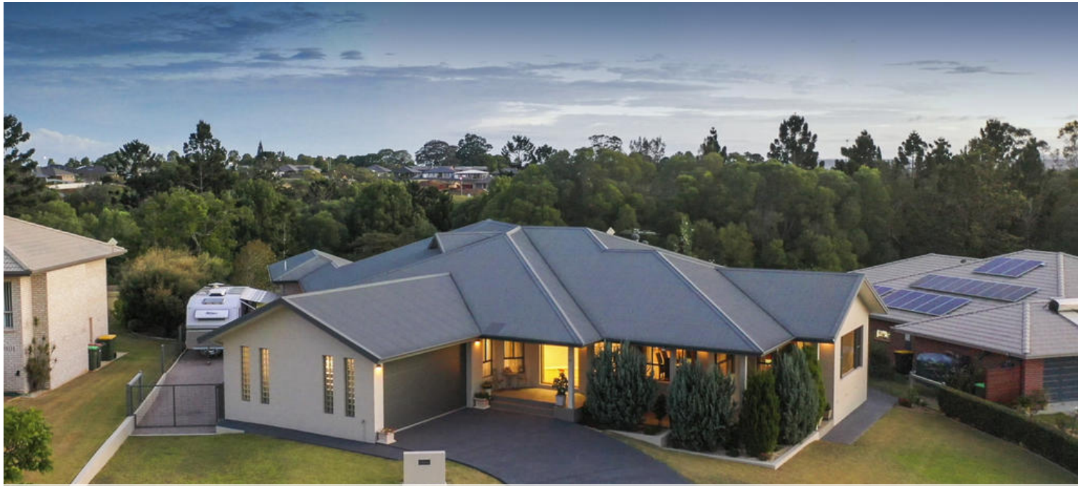
25 Nairn Tce, Junction Hill